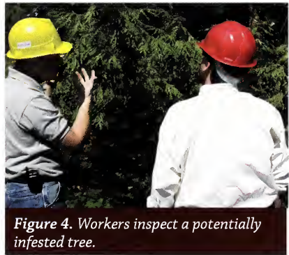
Figure 4. Workers inspect a potentially infested tree.

Individuals, businesses, and municipalities working with trees, nursery stock, cut wood, timber, woody debris, downed tree limbs, or firewood can help save trees by following the rules when living and working in regulated areas.